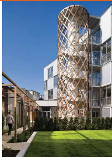
PegasusLife Hortley, Seaford