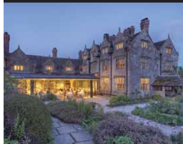
Gravetye Manor Hotel, West Hoathly