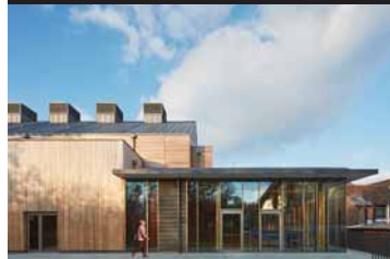
The New Bury Theatre, Hurstpierpoint College