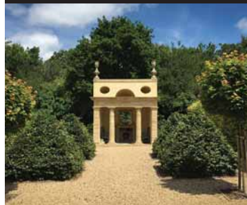
Clinton Lodge, Fletching